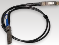
DDQ+DA0001 400G DAC, 1 m