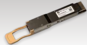
DDQ+85MP01D 400G 100 m optical transceiver