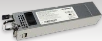
48V DC telecom-IN hot-swap power supply