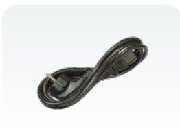
2 Power cords