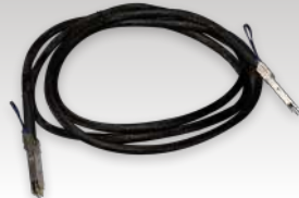
DDQ+DA00031 400G DAC, 3 m